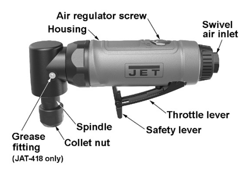
Figure 1 (JAT-418 shown)

CAUTION The die grinder must be properly lubricated before operation. See "Lubrication" section.