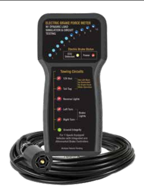
For 7-Spade Equipped Vehicles with Integrated and Aftermarket Brake Controllers