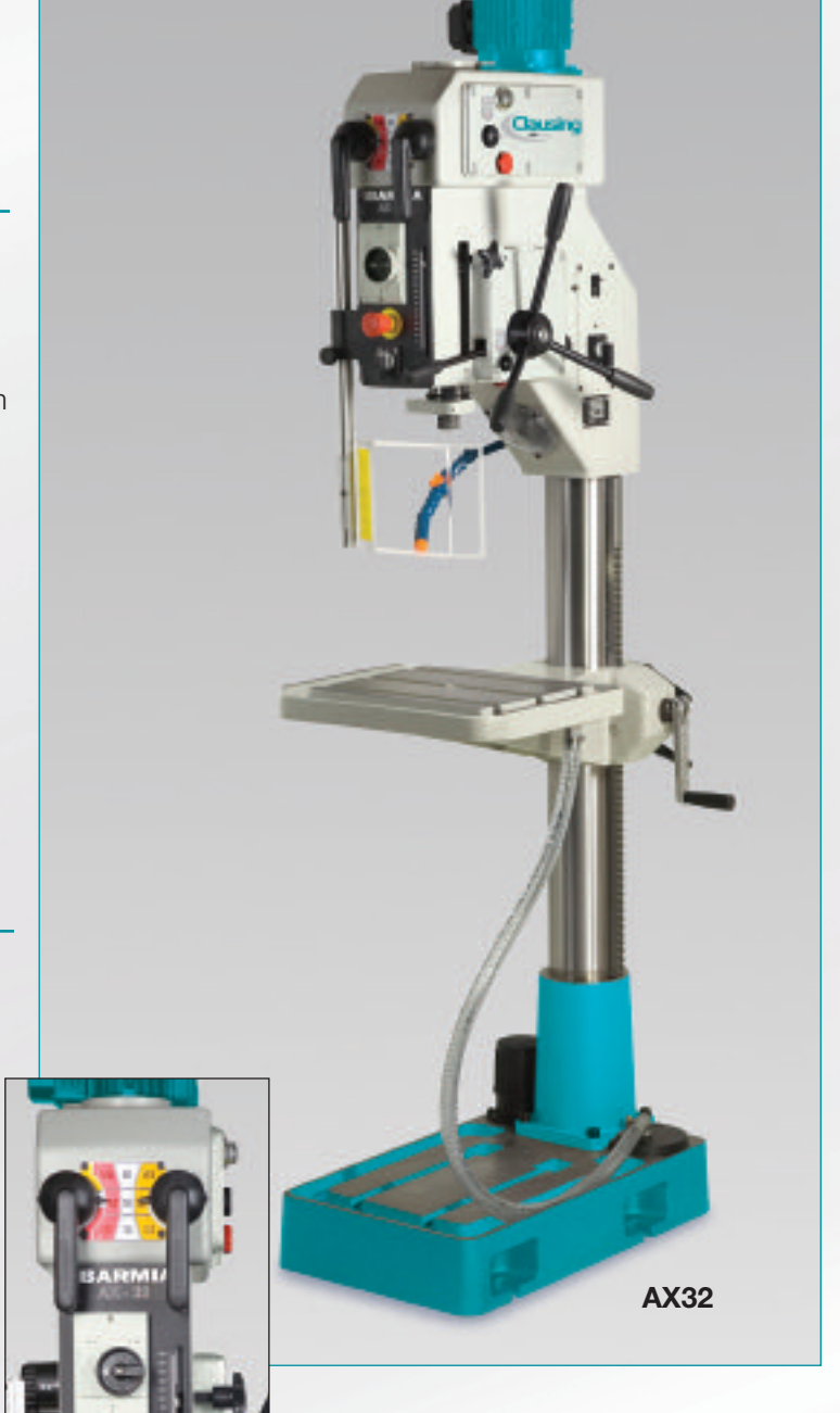
Head mounted speed controls for easy spindle speed setting