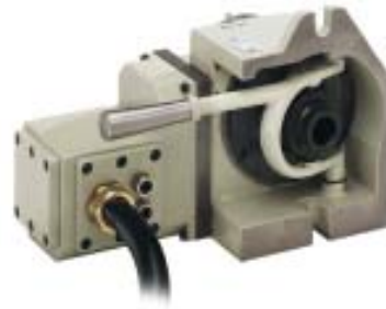
MODEL 5C (back)