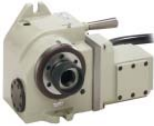
MODEL 5C (with manual 5C closer)