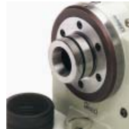
MODEL 5C (showing threaded spindle nose) 2 3/16 x 10