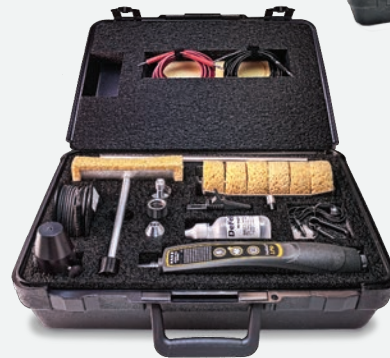
Complete Kit shown