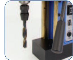
RB32-VSR Combination Drill & Tap