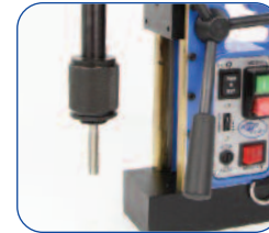
RB32-VSR With Tap