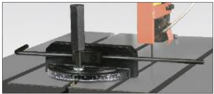
Miter Gauge for Hydraulic Table Shown