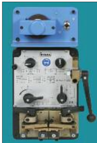
Clausing Installed Welder, Shear and Grinder. Welder Capacity: 1" Carbon Blades.