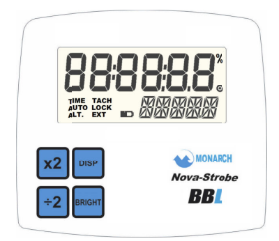
Figure 1 LED Strobe Control Panel

The Nova-Strobe Basic BBL LED (Light Emitting Diode) is a rugged portable battery powered LED Stroboscopes used for inspection and to stop motion to determine the speed of rotating objects. The unit has a pistol grip with lockable trigger switch and wrist strap for comfortable hand held operation or it may be mounted on a tripod using the integral ¼ -20 UNC thread at the base of the handle.